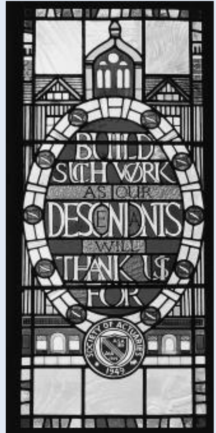
The SOA window displays a quotation by John Ruskin, author of the quotation that serves as the SOA motto, "The work of science is to substitute facts for appearances and demonstrations for impressions."

SOA members who find themselves in London are encouraged to undertake the pilgrimage to Staple Inn, to admire the stained glass in Staple Inn Hall, and particularly to take note of the three actuarial organizations' anniversary gifts. The Institute of Actuaries has extended its welcome, and the Institute staff, unless hard-pressed by other matters, will be most accommodating.