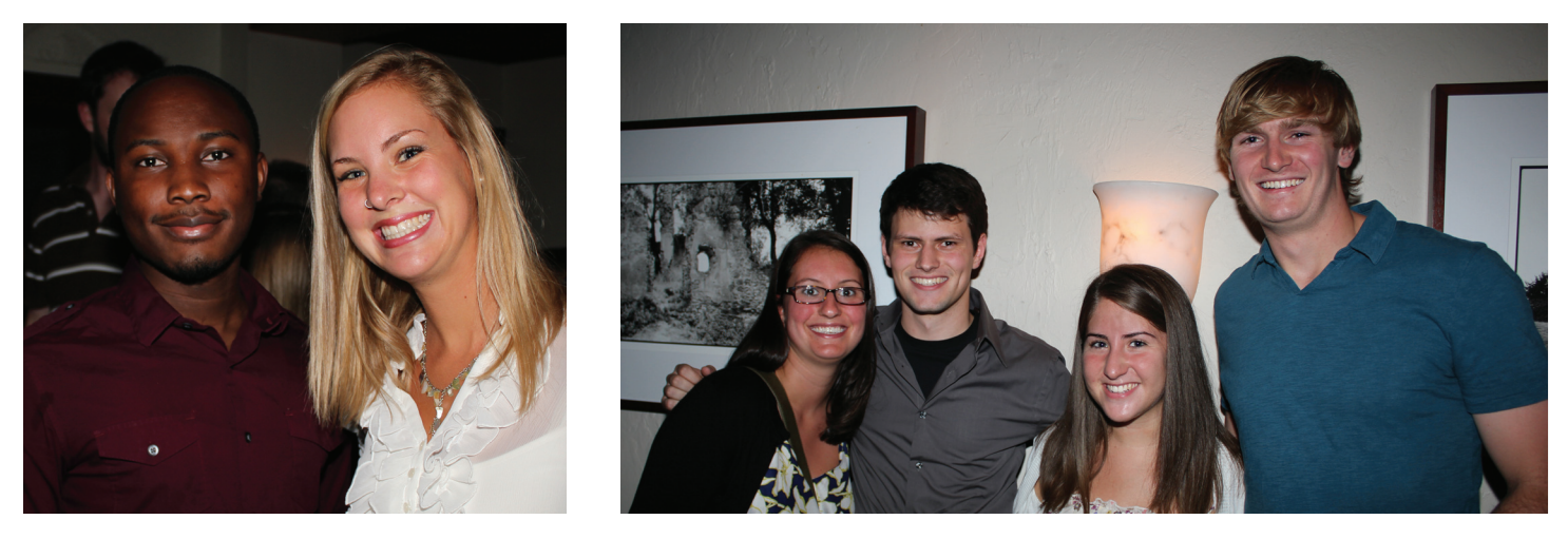
"IT IS TRULY AMAZING WHAT YOU CAN TAKE AWAY FROM SUCH AN EXPERIENCE."