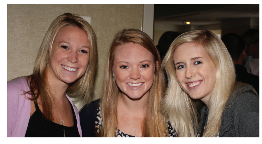
"... IT WAS A GREAT EXPERIENCE THAT I WILL REMEMBER FOR THE REST OF MY LIFE."