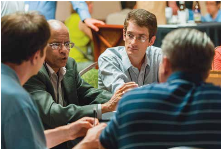
The ATC conference provided many networking opportunities for faculty.