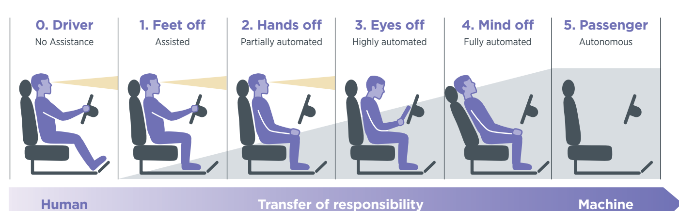
Figure 3: The five stages of vehicle autonomy