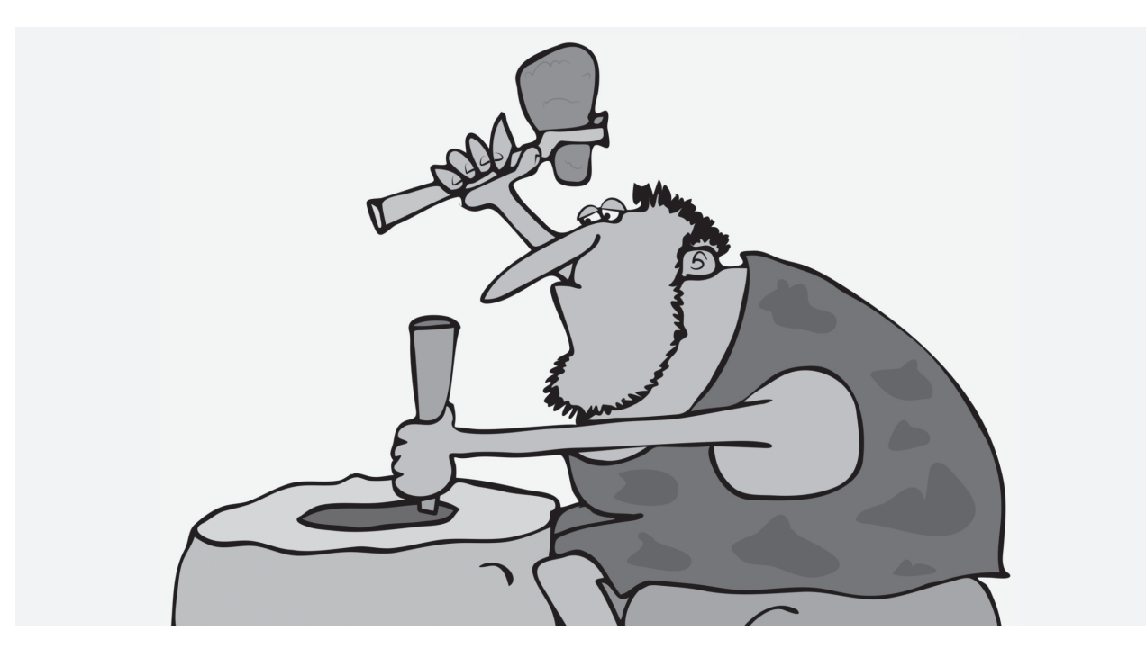
Actuarial modelers need to engage and leverage IT expertise in the design, maintenance, and control of actuarial models.

ith the movement to principle-based reserve (PBR) models in the United States, there is increased emphasis on actuarial model risk and model governance. Not surprisingly, model risk and model governance are fast becoming hot topics in the actuarial industry as companies search for solutions to increase transparency and manage model risk for some of their key decision-making tools. Models are experiencing increased scrutiny by regulators, auditors and management.