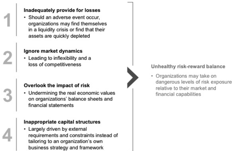
Exhibit 2: Shortcomings of traditional metrics