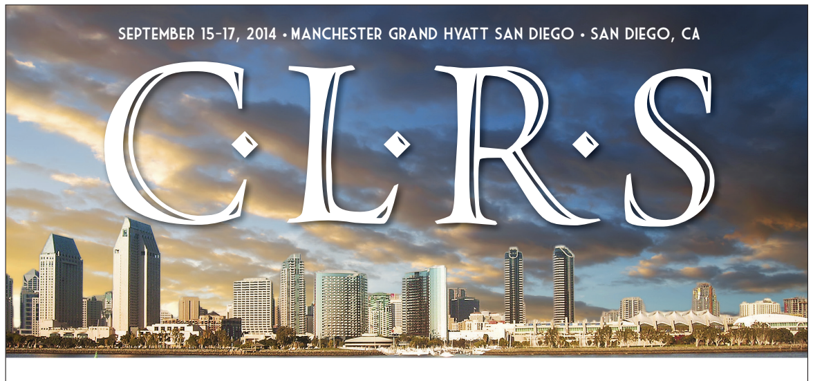
100 Years of Reserving... Where will it be 100 Years from Now?