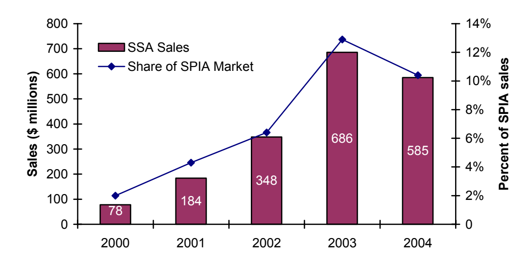
Figure 1 Substandard Annuity Market: Sales

Prior to 2004, domestic substandard annuity sales grew sharply, peaking in 2003 at $686 million and making up about 13 percent of total industry SPIA premium (Figure 1). In 2004, premiums exceeded half a billion dollars. This represented one tenth of the entire immediate annuity market that year, and 27 percent of the substandard annuity insurers' SPIA sales (Figure 2).