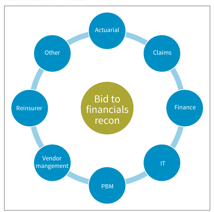
Figure 1 Reconciliation Process

aspect of the financial statements. Nevertheless, as actuaries, we are required to understand the data and not just accept whatever comes across our desk without scrutiny. Communication with the internal departments is the key to feeling comfortable with the data (Figures 1 and 2). The other departments should also run some preliminary reconciliations and quality checks before providing data to the actuary. It is a good idea for the actuary to check consistency with prior years' information.