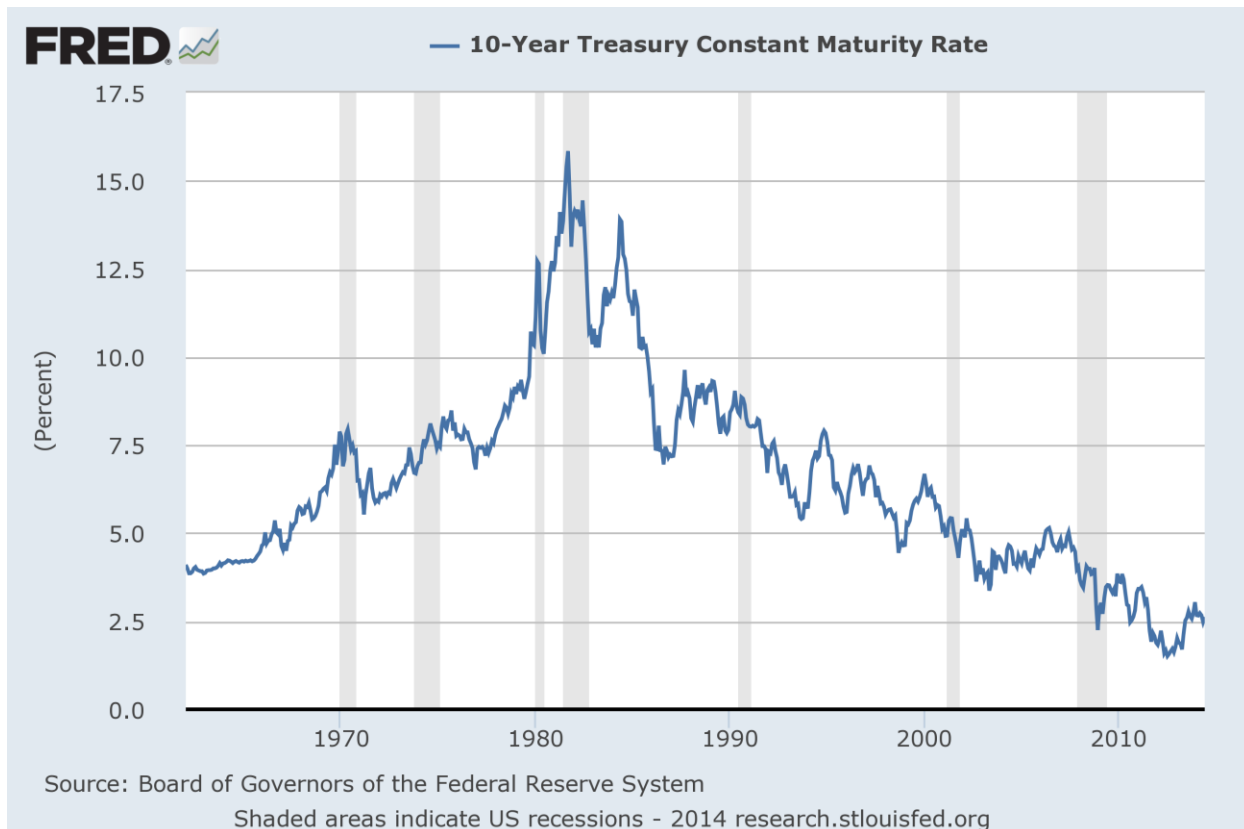
Chart 1 6

Interest rates can stay low for a long time, as we have seen in Japan, where they have been below 1 percent for over 20 years. Many now refer to a long-term low interest rate scenario as a “Japan” scenario.