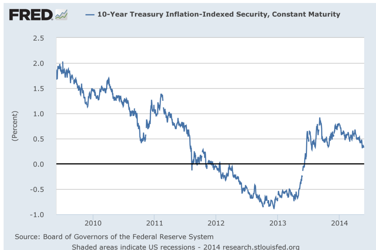
Chart 4 33

netting the rates in Chart 4 (10-year TIPS) and Chart 1 (10-year Treasury), an estimate for inflation expectations can be calculated. For example, at the end of April 2014 the 10-year CMT was 2.67 percent and the 10-year TIPS 0.49 percent, so expectations were for inflation of 2.18 percent.