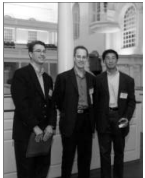
Members of the International Section enjoying the ambience of the Old South Meeting House during the section reception in Boston.