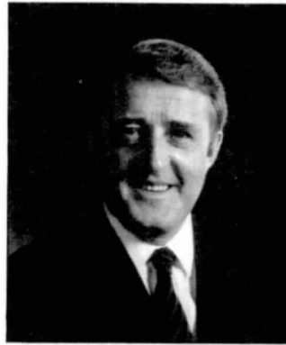
Prime Minister Brian Mulroney