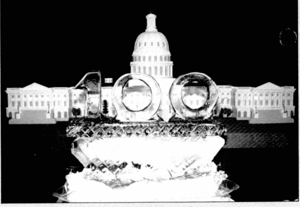
An ice sculpture and a replica of the Capitol were displayed as part of the decorative theme at the Monday evening reception.