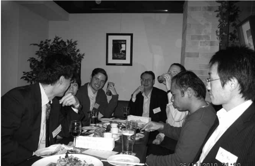
SOA members gather in downtown Tokyo.