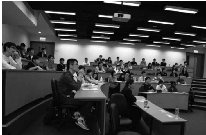
Student Panel session at the Chinese University of Hong Kong.