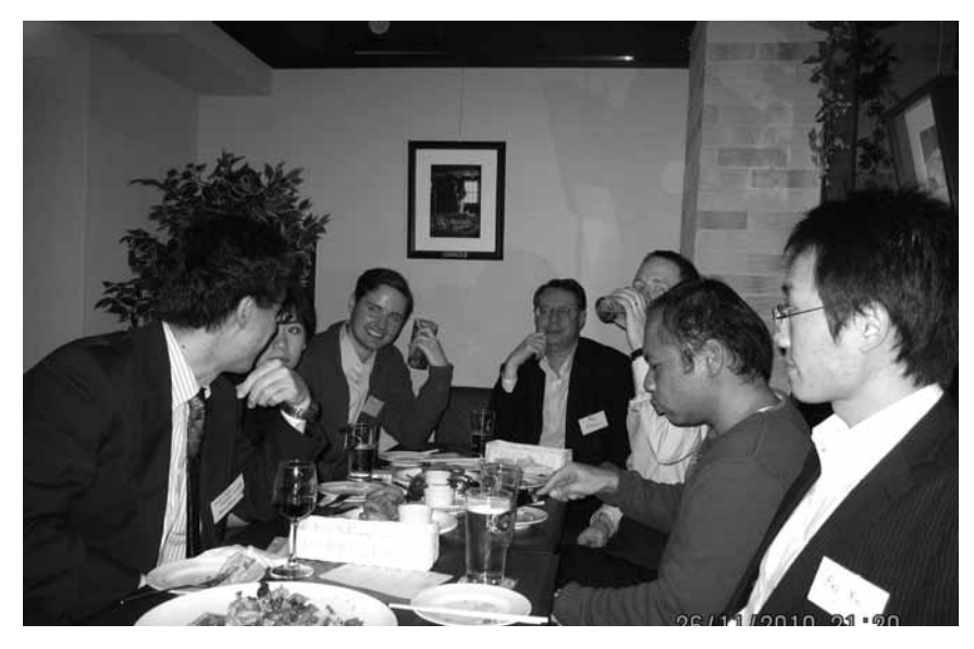
SOA members gather in downtown Tokyo.