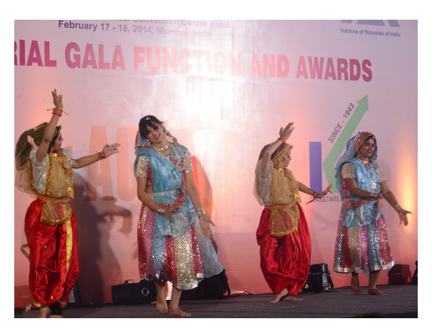
Welcome dance at the Actuarial Gala Function

under-privileged children and given a math quiz to be solved in 25 minutes, and to write in 30 words about "A Memorable Episode in my Mathematics Teacher's Class." The program ended with a tasty dinner for all participants.