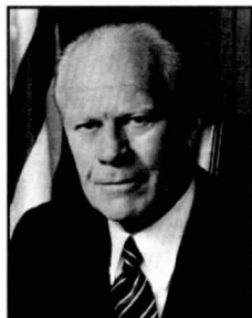
President Gerald Ford