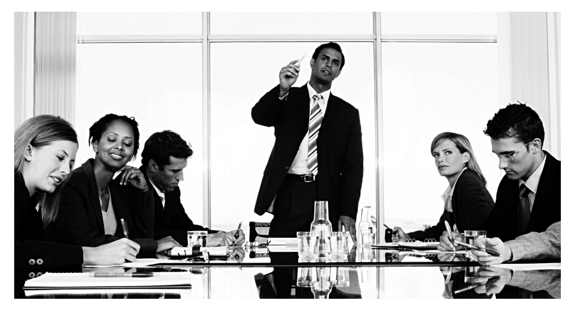
included new information on the rates of improvement for cognitive impairments as well as total lifetime disability.

Another session attempted to answer the question, "How can the inherent riskiness of different product designs be measured and compared?" An interactive session on rate increases was held and a new session "Actuarial Open Mic" allowed attendees to discuss earlier sessions more in depth in addition to consideration of many new topics. The actuarial track concluded Wednesday morning with a professionalism session that covered many items of importance for actuaries as well as a number of intriguing case studies.