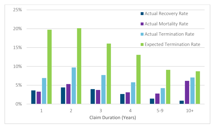
Figure 3.2 ACTUAL AND EXPECTED TERMINATIONS FOR ATTAINED AGES 50 +

The A/E claim termination ratios vary significantly by cause of disability. The following table provides a summary of ILWOP claim termination experience from 2003-2016 by diagnosis category. Note that the experience in many of the segments may not be considered credible given the low number of terminations. The A/E ratio corresponding to cancer claims (96.8%)—whose experience may be considered credible because it includes 8,358 claim terminations—is much higher than the overall A/E ratio of 54.7%. On the other hand, the A/E ratios corresponding to other claims, such as circulatory claims (45.3%), back claims (29.9%), and mental & nervous claims (34.8%)—which may also be considered credible—are lower than the overall result.