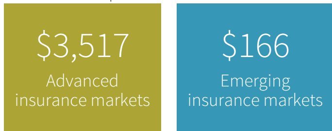
Figure 1 Annual Premiums per Person

2017 was an outlier year in terms of number and severity of natural catastrophes. According to Swiss Re, 1 a global reinsurer, the havoc caused by natural and man-made catastrophes was $337 billion, 2 of which $144 billion were losses paid by the insurance industry worldwide. Over the past 10 years, catastrophic losses adjusted for inflation have reached about 0.3 percent of global GDP. 3 However, there is an enormous gulf between the advanced and the emerging insurance markets. Whereas insurance density (i.e., annual premiums per capita) is $3,517 in advanced markets, 4 the emerging markets 5 reach a mere $166 (Figure 1). 6