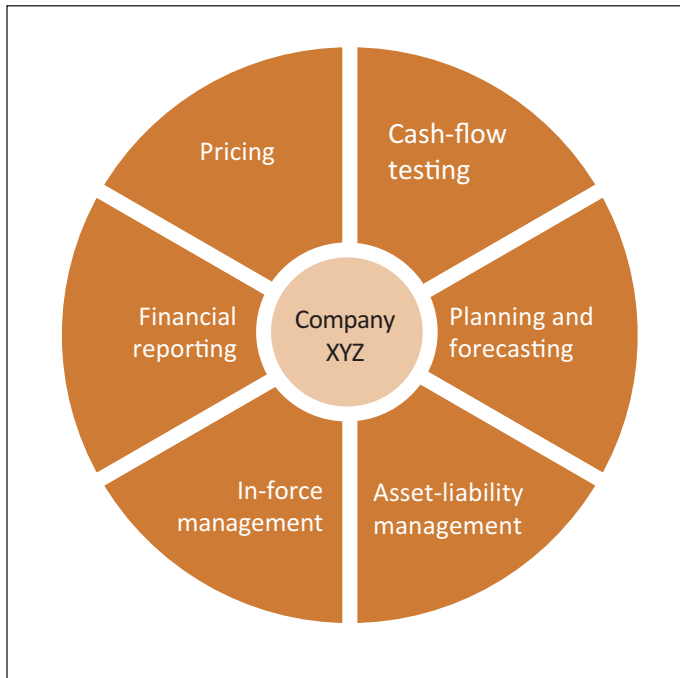
Figure 1 Common Actuarial Business Functions

Under a decentralized model development framework, a separate team is responsible for developing each model or group of models. In contrast, under a centralized model development framework, a single team is responsible for developing and