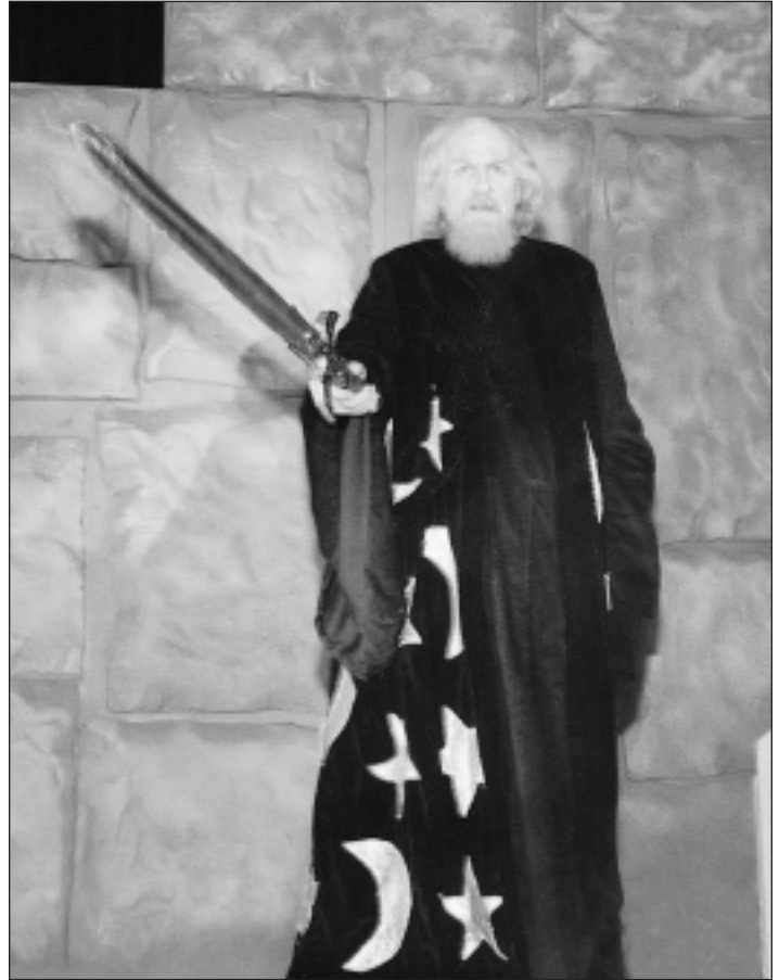
Merlin the Magician reminds the general session audience that the predecessors of today’s actuaries “challenged conventional thinking. They drew from the past and present to create a better future — just as you do today.”