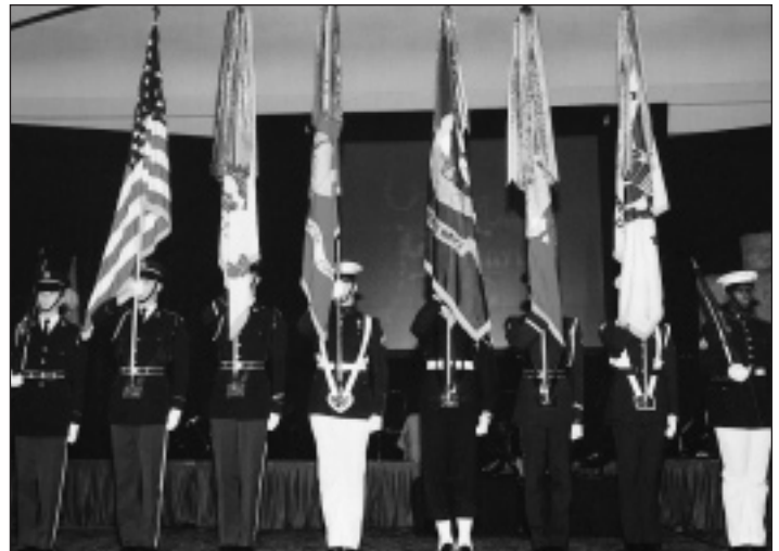
The Joint Armed Services Color Guard opens the general session of the SOA’s 48th annual meeting on Oct. 27.