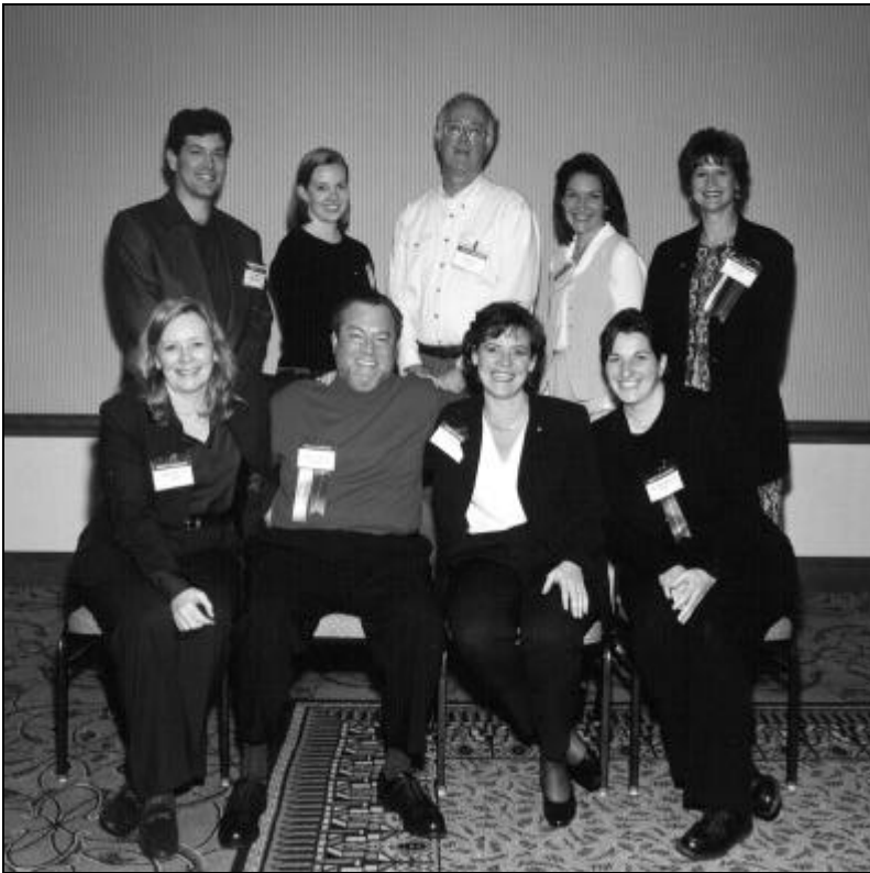
Council members gathered in Chicago to plan the future course of the Product Development Section -