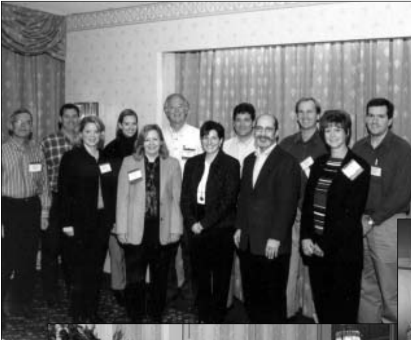
LEFT: Product Development Section Council members together in Boston to plan the 2003 activities of the section—