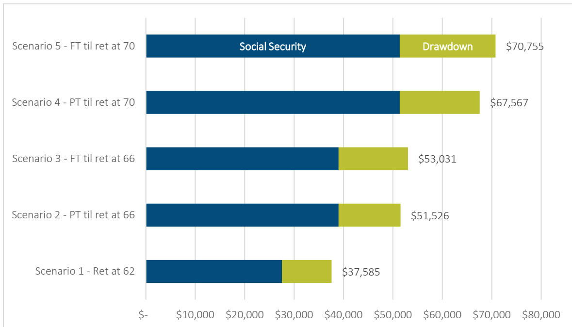
Figure 1 DELAYING RETIREMENT CAN SIGNIFICATNLY INCREASE INITIAL TOTAL RETIREMENT INCOME