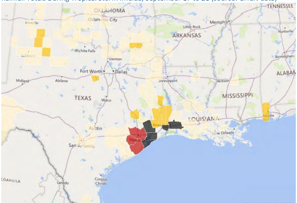
Figure 2 Rainfall Totals During Tropical Storm Imelda, September 17 to 21

This map shows rainfall totals for the period from September 17 to 21, 2019. For those counties with more than one GHCN weather station, the station with the maximum rainfall was used. Note that not every county has a GHCN weather station and, as a consequence, the map may understate the geographic footprint of the storm.