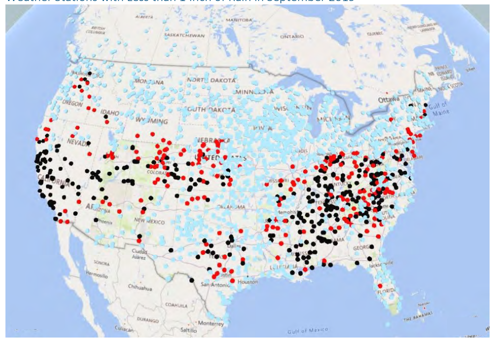
Figure 8 Weather Stations with Less than 1 Inch of Rain in September 2019