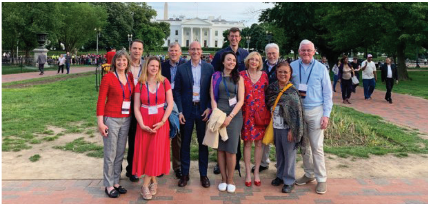
Some of our networking group in front of the White House as we walked to Ocean Prime