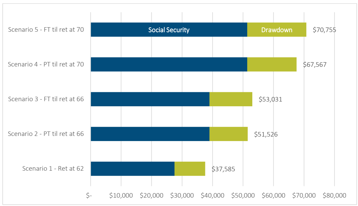
Figure 1 DELAYING RETIREMENT CAN SIGNIFICATINLY INCREASE INITIAL TOTAL RETIREMENT INCOME