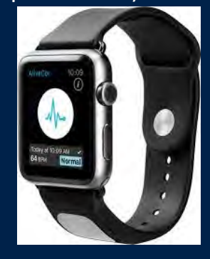
AliveCor Portable EKG