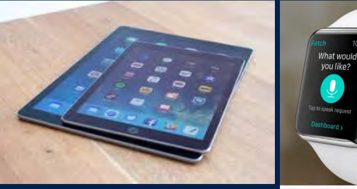
Siri and Apple