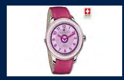
Limmex Security Watch (Multiple dealers)