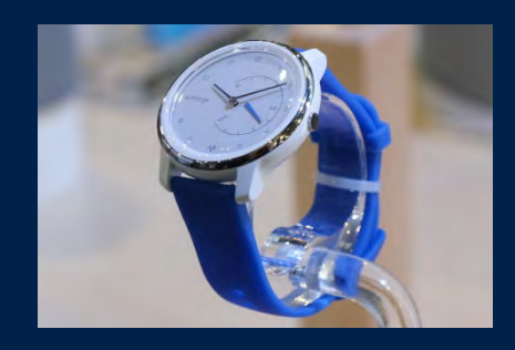
Withings Move (ECG)