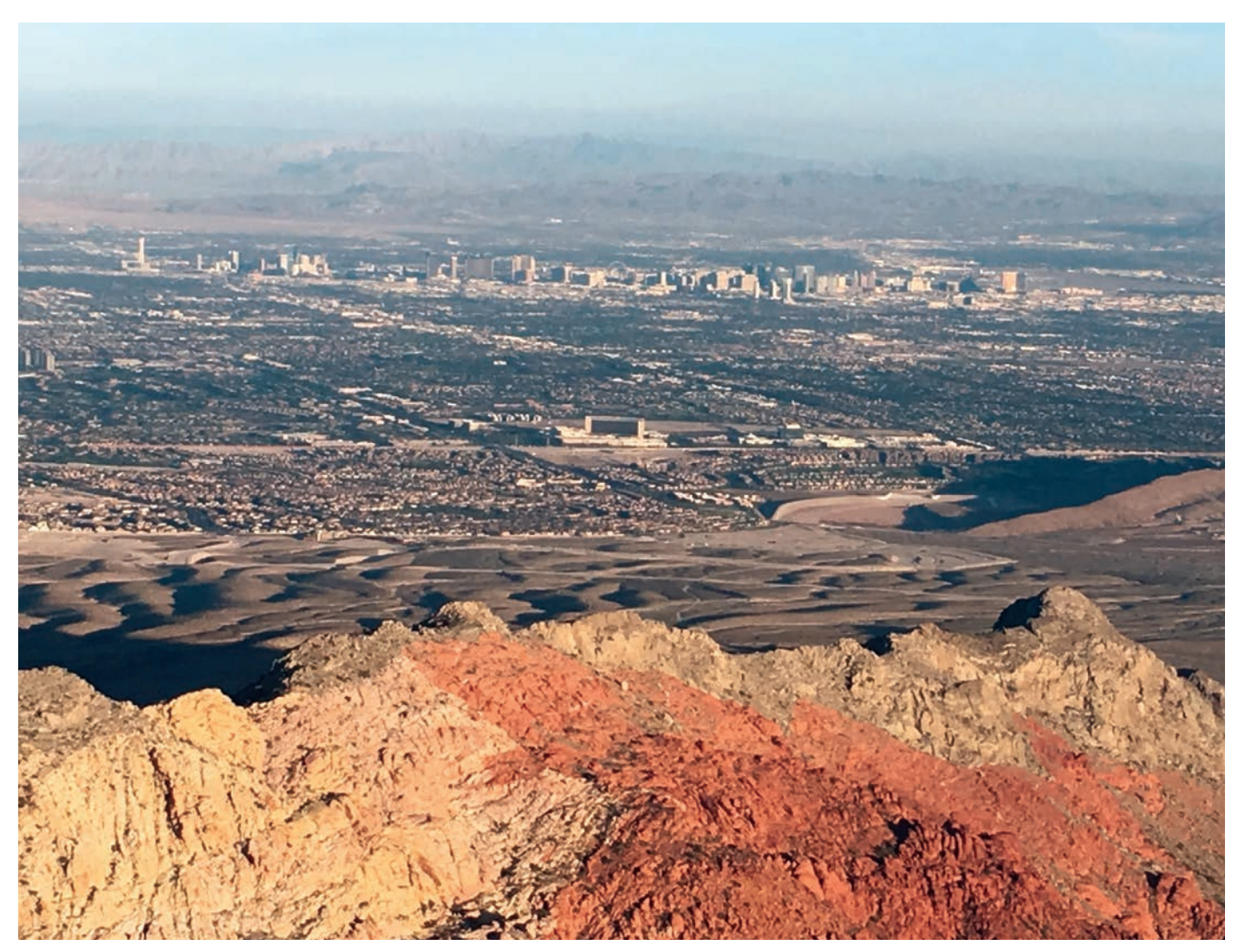
Las Vegas from peak of Turtlehead Mountain in Red Rock Canyon.