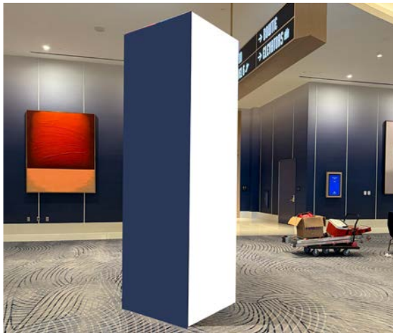
Free Standing Columns

Contact Lauren Scaramella to discuss branding and pricing.